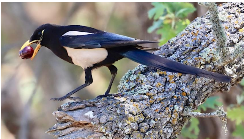
Yellow-billed Magpie

May 2 Day 8: Sea Cliffs, Savanna, and Chaparral. Today we will travel through country known for the California endemic, Yellow-billed Magpie, whose populations have been vastly reduced by the West Nile virus and thus are more difficult to locate. Before breakfast we will stop at a rocky cliff overlook to scan for Black Oystercatcher and late-departing winter visitors like Wandering Tattler, Black Turnstone and Surfbird. Pigeon Guillemots nest here in large numbers and Sea Otters are usually seen.