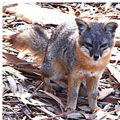
Santa Cruz Islandt Fox

May 3, Day 9: Pelagic Trip; Santa Cruz Island. Our catamaran departs at 9:00 a.m. for Santa Cruz Island via Ventura Harbor. Pelagic birding to and from the island should produce Pacific Loon in breeding plumage, Sooty and maybe Pink-footed shearwater, possibly Pomarine or Parasitic jaeger, and a good chance of Scripps's Murrelet. Rhinoceros and Cassin's auklets and whales are sometimes seen on our way to and/or back from the island. Red-necked and Red phalaropes are also possible. Once we dock at Prisoners Harbor, we will look for