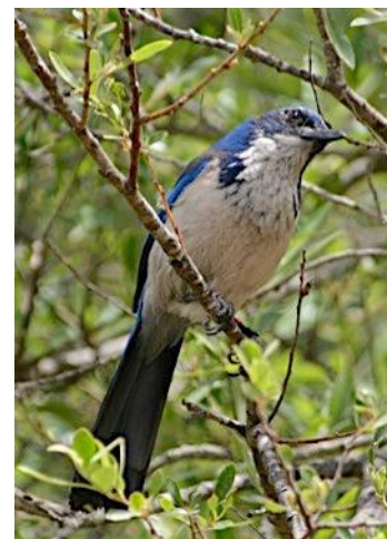
Island Scrub-Jay

The last birding day of the tour combines the romance (although, hopefully, not the pain) of a pelagic trip with the opportunity to find one of North America's most restricted endemics, the Island Scrub-Jay of Santa Cruz Island. After leaving Ventura Harbor, we'll watch for both Sooty and Pink-footed shearwaters. Flocks of beautiful, breeding plumaged Pacific Loons fly swiftly up-channel on their way to their tundra breeding sites. We may be fortunate and see Pomarine and/or Parasitic jaegers as well. Nearing the island we hope to encounter Scripps's Murrelet, which breeds on the Channel Islands. The island itself should produce endemic races of Allen's Hummingbird (non-migratory), Western Flycatcher, Orange-crowned Warbler, and Song Sparrow, as well as the occasionally difficult Island Scrub-Jay.