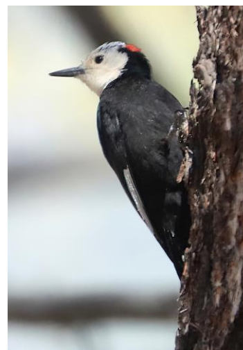
White-headed Woodpecker © Gary Small

In the southwest corner of the San Joaquin Valley, our base in Taft provides close access to the habitat of the virtually mythical LeConte's Thrasher. We'll try for this very local, difficult species in a location considered the best in California for seeing this phantom bird. Following our morning thrasher quest, we will travel well up the slope on nearby Mount Pinos, whose summit exceeds 8,000 feet in altitude. The old-growth Jeffrey pine forests here are a delight, and birding in the cool, higher elevations should produce encounters with Band-tailed Pigeon, White-headed Woodpecker, Steller's Jay, Mountain Chickadee, Pygmy Nuthatch, Green-tailed Towhee, the thick-billed stephensi race of Fox Sparrow (a likely future split candidate), and Cassin's Finch. Mountain Quail, while difficult, are resident here.