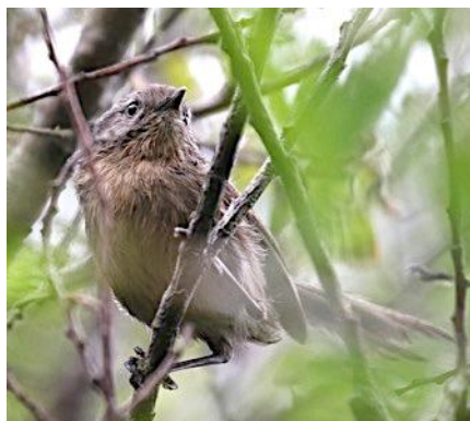
Wrentit