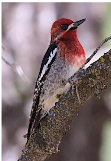
Red-breasted Sapsucker