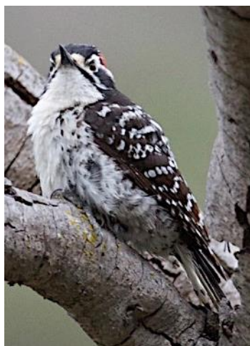
Nuttall's Woodpecker © Tom Wilberding