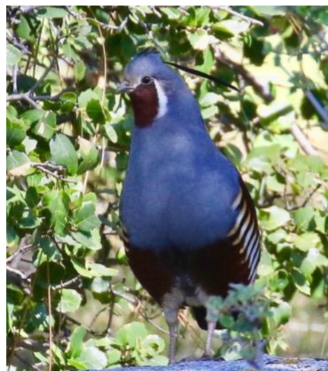
Mountain Quail