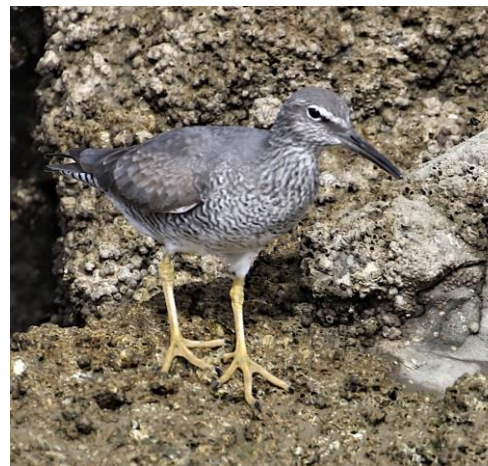
Wandering Tattler

Traveling down the coast on our way to Santa Barbara, we will bird coastal southern San Luis Obispo and Santa Barbara counties for western migrants and breeding species including Allen's Hummingbird, Nuttall's Woodpecker, Western Flycatcher, Wrentit, American Goldfinch, California Towhee and Hutton's Vireo.