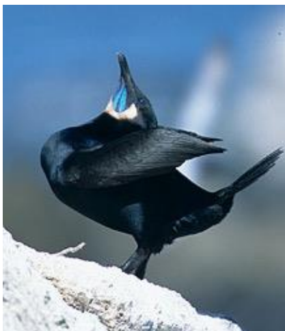
Brandt's Cormorant