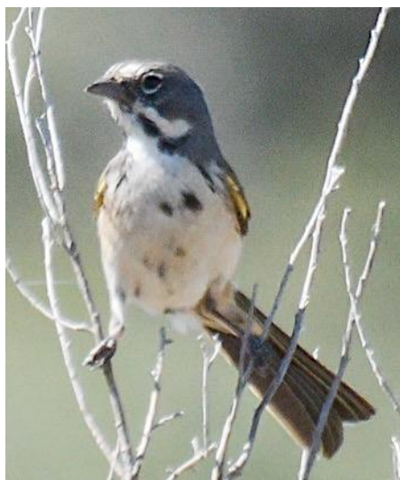
Bell's Sparrow

April 30, Day 6: Big Morongo to Taft, Kern County. We will get an early start today at Big Morongo, which will permit us to walk some of the trails as well as check the feeders again for any target birds we may have missed yesterday. Then we will start the drive to Taft in Kern County via the road that leads up to Mount Pinos. Here we often pick up White-headed Woodpecker, Mountain Chickadee, White-breasted, Red-breasted and Pygmy nuthatches, Red-breasted Sapsucker, and Steller's Jay. If we arrive in sagebrush lowlands early enough, we will search the desert sagebrush vegetation between Taft and Maricopa for the elusive and shy LeConte's Thrasher and also look for the recently split off Bell's Sparrow.