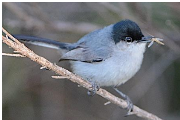
California Gnatcatcher

After lunch we will enjoy some coastal San Diego birding where Elegant Terns, Black Skimmers, Western Gulls and many shorebirds and other waterbirds are possible. Near the Mexican border we will visit the Birds and Butterfly Garden where migrating species flock to Grevillea trees and Common Ground Dove is possible. We will end our day at the Tijuana Slough National Wildlife Refuge where we hope to see the recently split Ridgway's Rail and maybe Yellow-crowned Night-Heron, a species only reliably found near San Diego in California.