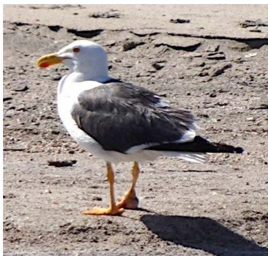
Yellow-footed Gull