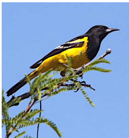
Scott's Oriole © Dave Drake