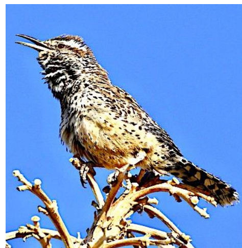
Cactus Wren

April 28, Day 4: Salton Sea. Although difficult to find at this time of year, we'll try for any lingering, wintering Yellow-footed Gulls, but also search for Crissal Thrasher, Gila Woodpecker, Black-tailed Gnatcatcher, Cactus Wren, Abert's Towhee, Ridgway's Rail (a recent split from Clapper Rail) and the thousands of waders and gulls found this time of year. You will be amazed at the spectacle. Burrowing Owl is guaranteed with our record being 29 in one day. Finney Lake is our best bet for Common Ground Dove, Inca Dove, and Least Bittern (rare) while