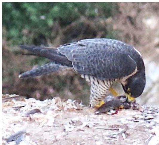
Peregrine Falcon

Our motel in Pismo Beach sits atop a sea cliff complete with nearby Peregrine Falcon eyrie and nesting Pelagic Cormorants and Pigeon Guillemots. A morning watching Brandt's and Pelagic cormorants, Pigeon Guillemots, gulls and other shorebirds always proves interesting. Moving downcoast toward Santa Barbara, we'll stop at a variety of good birding venues, looking for birds that inhabit rocky shorelines and woodland/savanna species, including the endemic Yellow-billed Magpie.