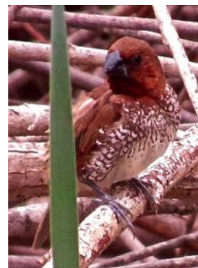
Scaly-breasted Munia

NIGHT: Hampton Inn San Diego Mission Valley, San Diego