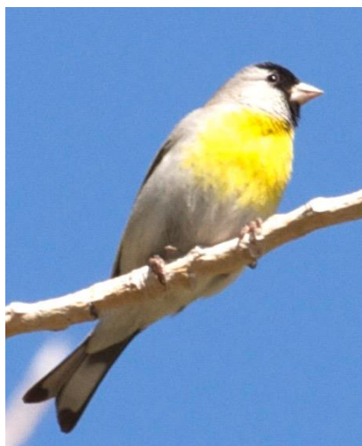
Lawrence's Goldfinch

An entire day will be devoted to birding the southern end of the Salton Sea, a unique body of water in a below-sea-level desert sink, whose only outlet is through evaporation. For this reason, its water is much saltier than the ocean and supports only three or four species of fish. Due to its unlikely location in the middle of a desert, however, the sea functions as a natural magnet for gulls and shorebirds. The waterbird spectacle here can be truly remarkable! Sometimes, a few Yellow-footed Gulls stay to overwinter and we will attempt to find one. These gulls are rare in the Salton Sea at this time of year, but this is the only place outside Mexico where they may be found. The desert scrub in the region holds Gambel's Quail, Burrowing Owl, Ladder-backed Woodpecker, Crissal Thrasher, Common Ground Dove, Inca Dove, Black-tailed Gnatcatcher, Gila Woodpecker, and Abert's Towhee, all of which we will endeavor to see first thing in the morning.