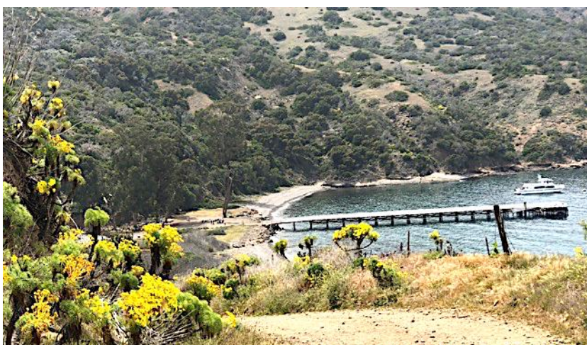
View of Santa Cruz Island's Prisoners Harbor